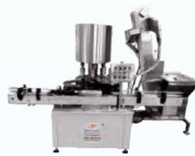
Automatic Screw Cap Sealing Machine