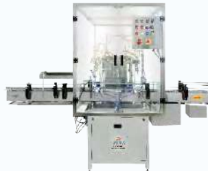
Milk Filling Machine