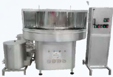
Bottle Washing Machine