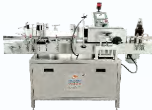
Sticker Labelling Machine