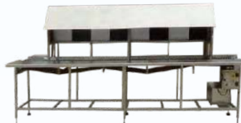
Visual Inspection Conveyor Machine