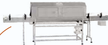
Steam Operated Shrink Tunnel