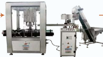
Automatic Rotary Screw Capping Machine