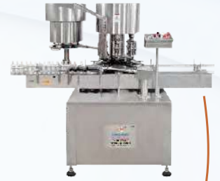
Crown Capping Machine