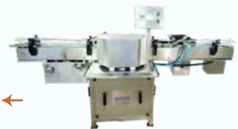
Pressure Leak Check Machine