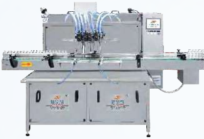
Automatic Servo Filling Machine