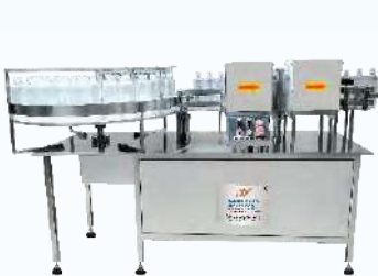
Airjet Bottle Cleaning Machine