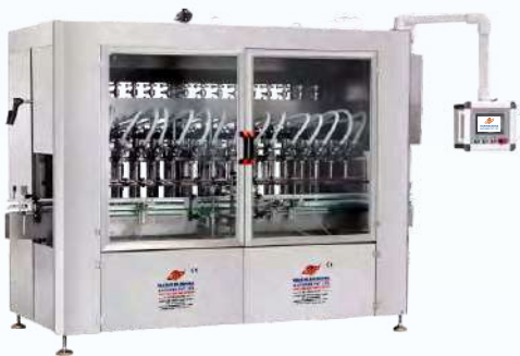
Automatic Linear Liquid Filling Machine