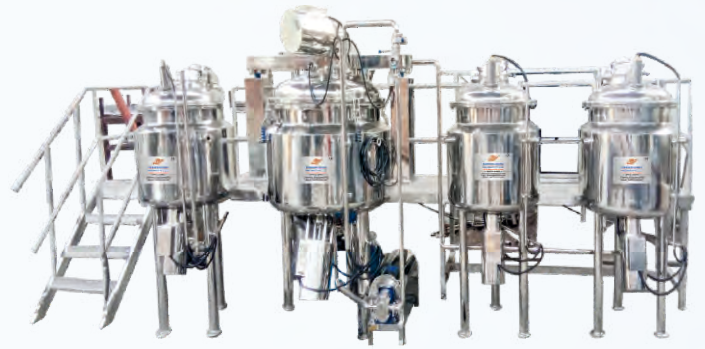
Ointment / Cream Mfg. Plant