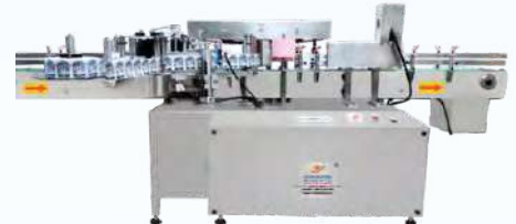
Automatic Sticker Labelling Machine (For Round | Flat Bottle)