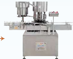
Bottle Capping Machine