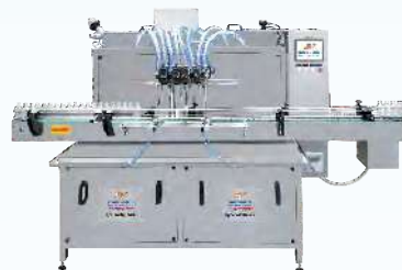
Liquid Filling Machine