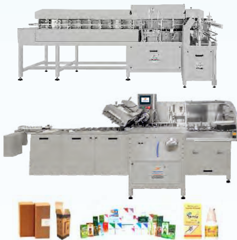
Semi-Automatic & Automatic Cartoning Machine with Output Speed 50 PPM to 300 PPM