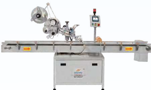
Automatic Top and Side Sticker Labelling Machine