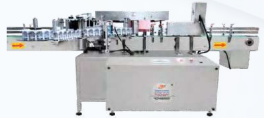
Automatic Double Side Labelling Machine For Round & Flat Bottles