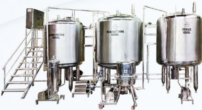
Liquid Syrup Mfg. Plant