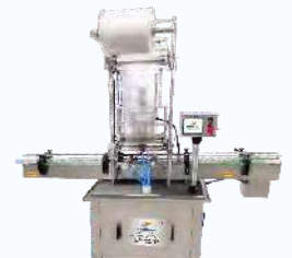
Automatic Conduction Sealing Machine