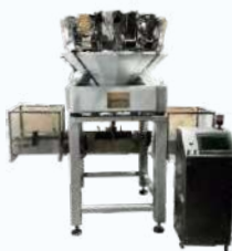
Dry - Fruit Filler