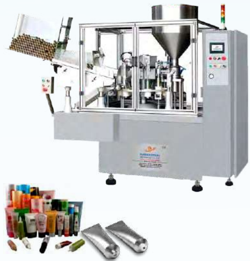
Semi-Automatic / Automatic Tube Filling & Sealing Machine With Output Speed 25 To 150 PPM