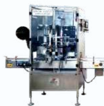
Shrink Sleeve Applicator