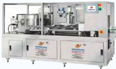
Un-Scrambler With Air Jet Cleaning