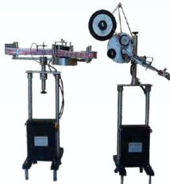
Standalone Hologram / Excise Label Applicator Machine