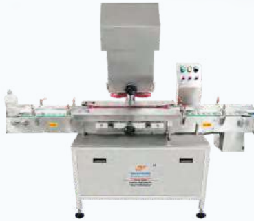
Automatic Linear Cap Sealing Machine