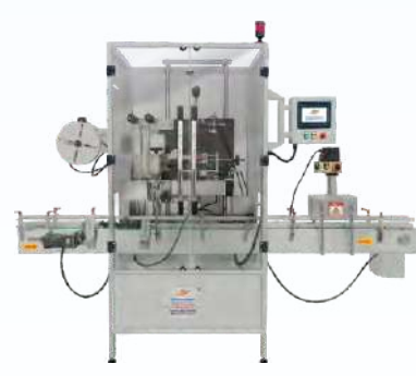
Automatic Shrink Sleeve Label Applicator Machine